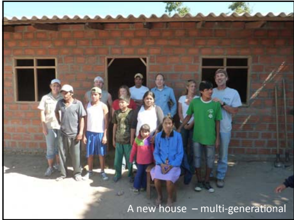
A new house – multi-generational