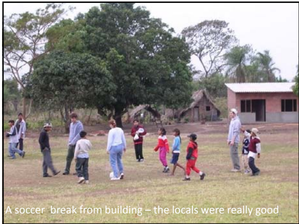
A soccer break from building – the locals were really good