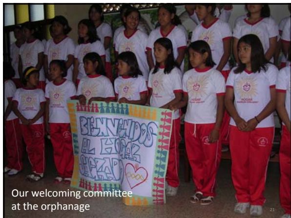
Our welcoming committee at the orphanage