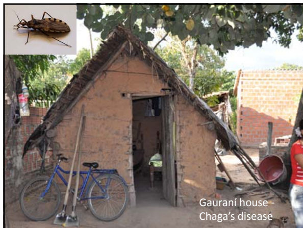
Gauraní house - Chaga's disease