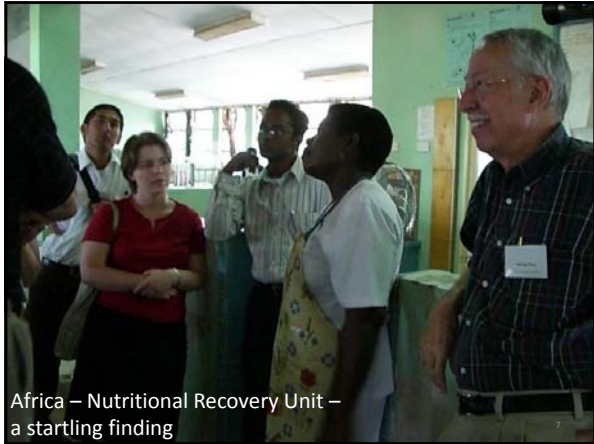
Africa – Nutritional Recovery Unit – a startling finding