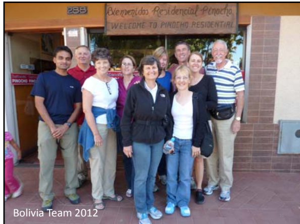
Bolivia Team 2012