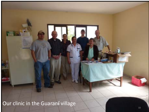
Our clinic in the Guaraní village