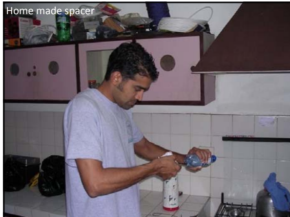
Home made spacer