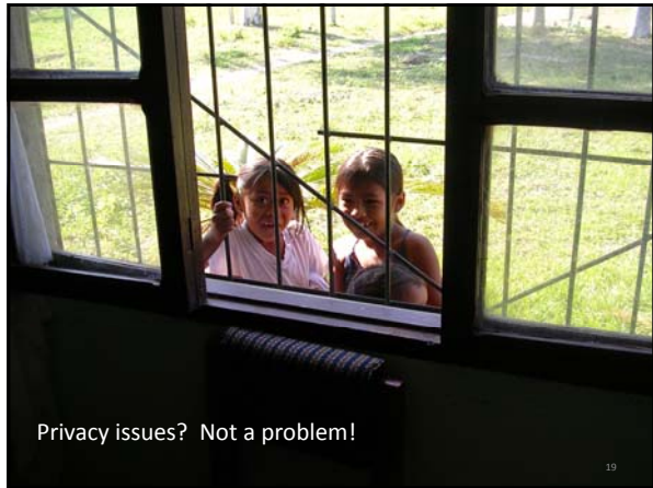
Privacy issues? Not a problem!